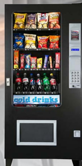
4-Wide LTC with Optional SCCD High Capacity Can Tray